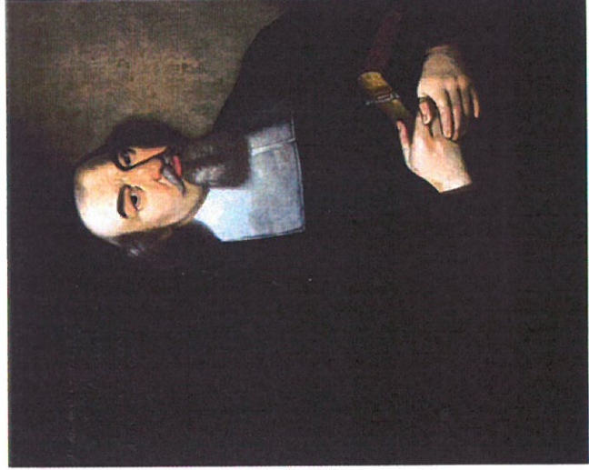
Abraham Calov 1612-1686