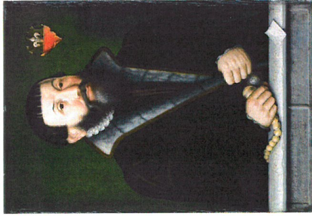
Martin Chemnitz 1522-1586