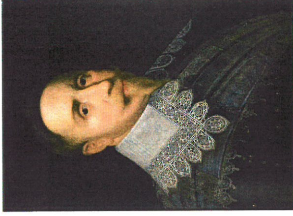
Gustavus Alophus King of Sweden 1594-1632