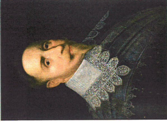
Gustavus Alophus King of Sweden 1594-1632