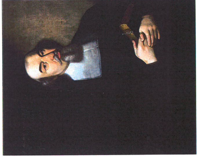
Abraham Calov 1612-1686