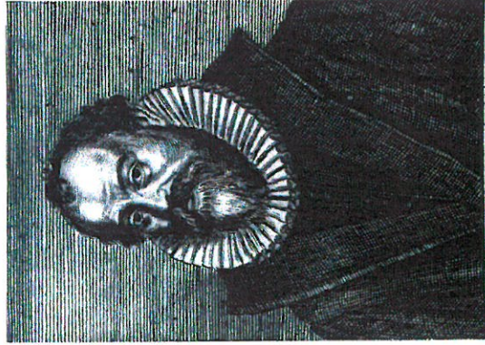
JOHANNES GERHARDUS Theol. Jenensis. John Gerhard 1582-1637