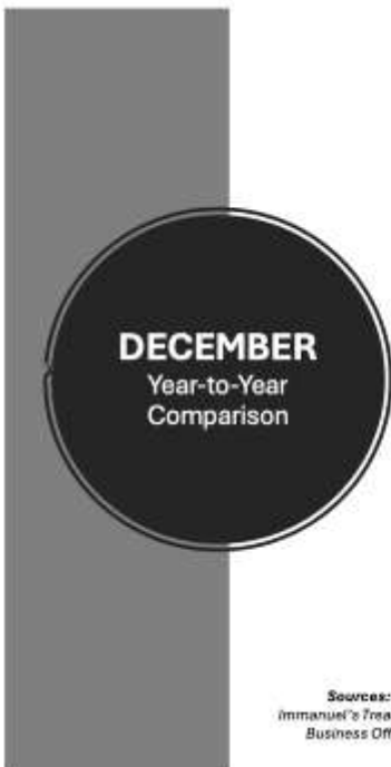
6th Months of Immanuel's Fiscal Year 2024/25 (July 1st thru June 30th)